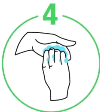
The back of the fingers