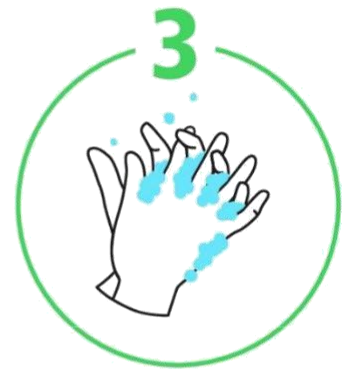
In between the fingers