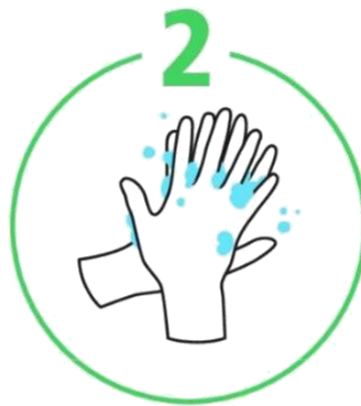
The backs of hands