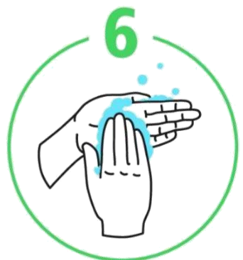
The tips of the fingers

Use a tissue to turn off the tap. Dry hands thoroughly.