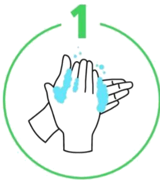
Palm to palm

Wash your hands with soap and water more often for 20 seconds